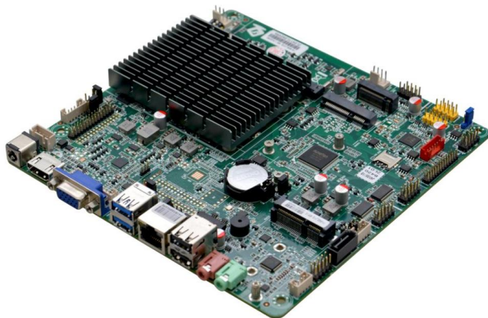
ITX-B420_J112L VER:1.0 主板侧面图